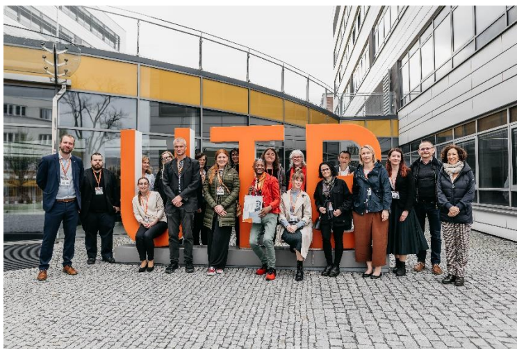
TBU International Week 2023